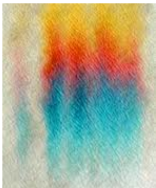
Color moving on paper

The ink pigment dissolves in the water because it is water-soluble. As the water travels up the paper by capillary action, it carries the pigment along with it. How fast each pigment travels depends on the size of the pigment molecule and on how strongly the pigment is attracted to the paper. The spaces between the fibers in the paper act as capillary tubes.